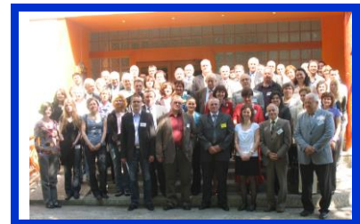
Vinianske jazero lake 2011 ... photo of participants